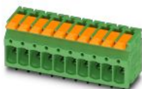
The figure shows an 10-position version

Please be informed that the data shown in this PDF Document is generated from our Online Catalog. Please find the complete data in the user's documentation. Our General Terms of Use for Downloads are valid ( http://phoenixcontact.com/download )