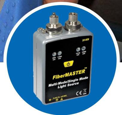
Multi-Mode/Single Mode Light Source