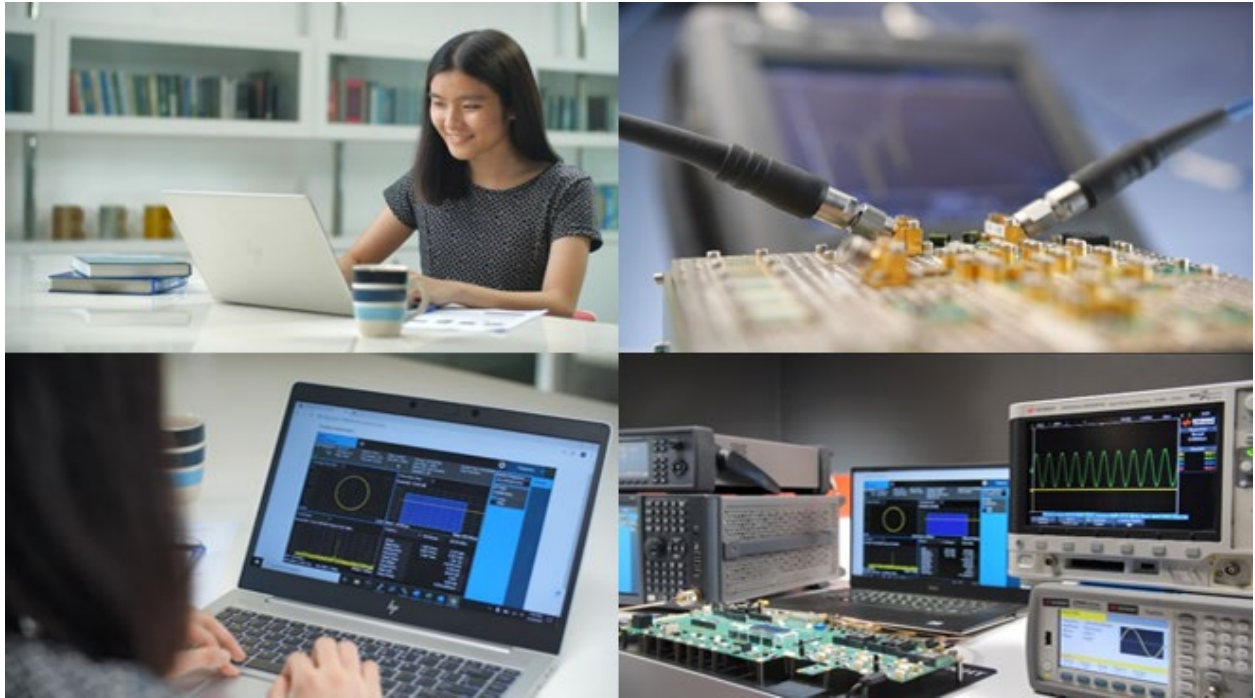
Figure 2. Shift the lab learning experience online with end-to-end remote lab solution

The Keysight industry-ready remote access lab solution takes remote learning to the next level of digital transformation, moving you beyond simulation and theory to real-world experience - simply at a distance.