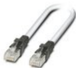
Patch cable, CAT5, assembled, 0.5 m

Patch cable - FL CAT5 PATCH 0,5 - 2832263