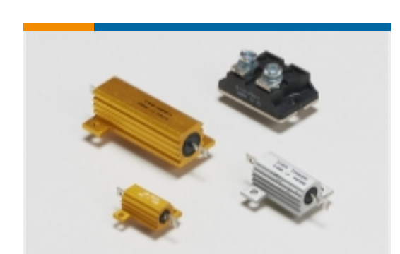
Chassis Mount Resistors(747)