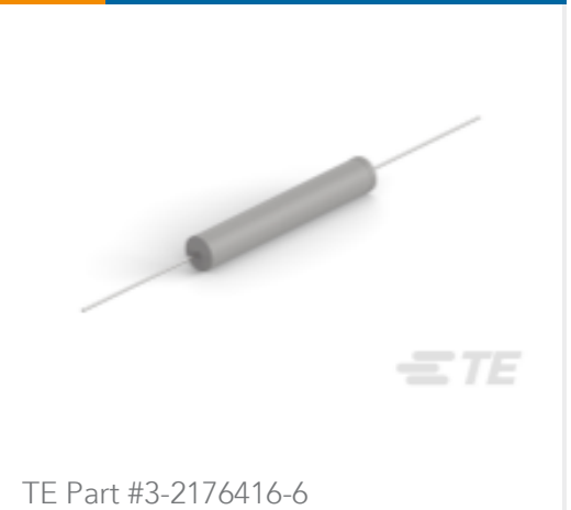
9W STD M/OX 5% 1K5