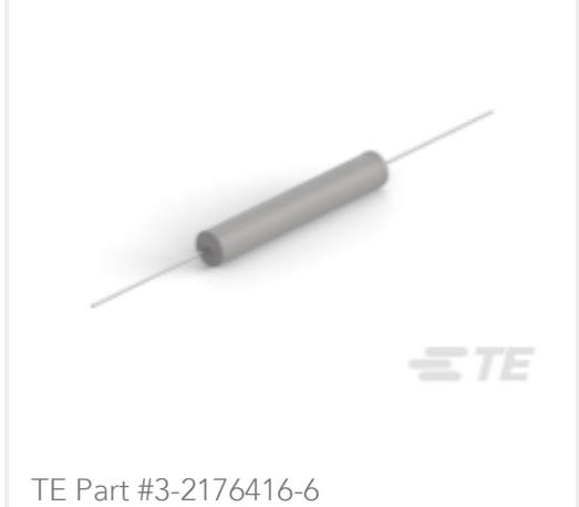
9W STD M/OX 5% 1K5