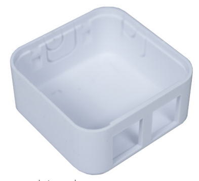
Box cover internal