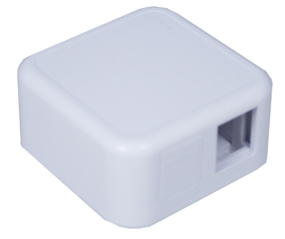
Unloaded box with blank in place

An attractive surface mount housing for one or two keystone outlets. The slick, compact design measuring 560 \times 560 \times 260 mm; can be used for a multitude of applications requiring surface mounted network outlets, including P.O.S, Wireless Access Points, Smart TV Cabling, Home and Small Office wiring. The keystone fitting allows for the use of standard Cat 5e or Cat 6 outlets. White keystones are available to match the outlets. The Connectix Keystone Outlet Box is supplied with one port blanked off, ready for single port applications. The blank can be easily removed if both ports are required which creates a low cost, highly durable product, for a quick installation turnaround.