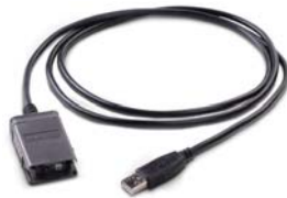
U5481A IR-to-USB cable