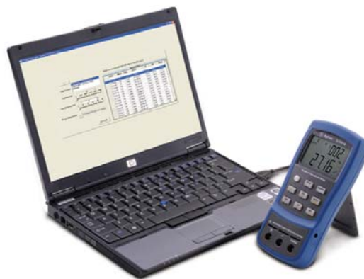
Figure 1: Automate the recording of continuous readings when you hook the U1701A to a PC

The U1701A comes in a robust overmold and tested to stringent industrial standards. Each U1701A is also sealed with a three-year warranty and the assurance that you can test your components with confidence.