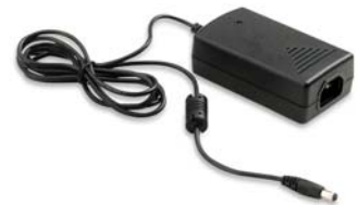
U1780A Power adapter and cord (according to country)