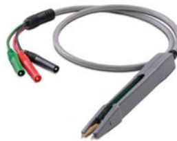
U1782A SMD tweezer