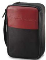
U1174A Soft carrying case