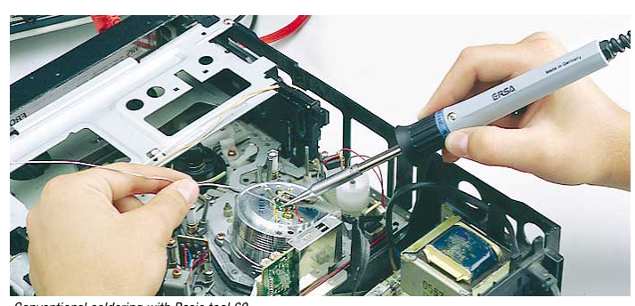
Conventional soldering with Basic tool 60

internally heated ERSADUR soldering tips make this versatile soldering station suitable for most industrial soldering applications. The multifunctional holder with its swiveling sponge container also functions as a hot tip holder. In addition, the holder is designed so that you can use ERSA soldering irons with virtually any commercially available solder fume extraction system provided you have an adapter.