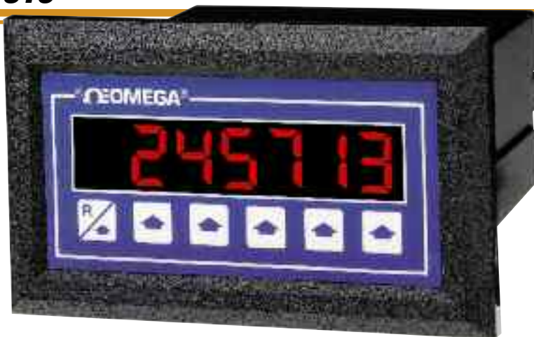
DPF75, shown smaller than actual size.