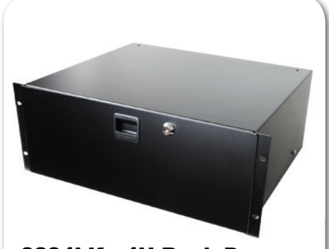
3234LK - 4U Rack Drawer