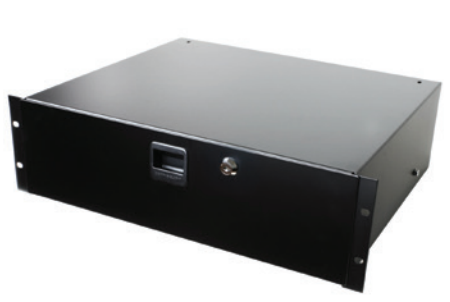
3233LK - 3U Rack Drawer