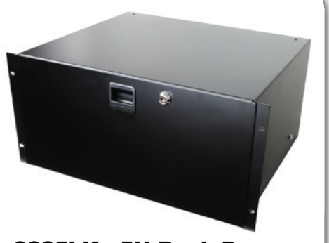
3235LK - 5U Rack Drawer