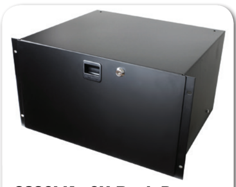
3236LK - 6U Rack Drawer