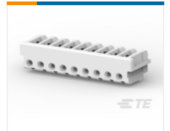
TE Part #179228-3 AMP COMMON TERMINATION HOUSINGS