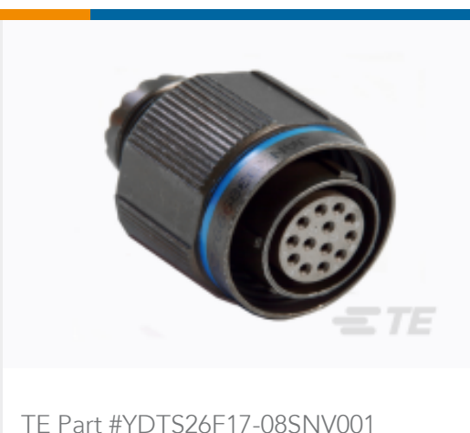
TE Part #YDTS26F17-08SNV001 Straight Plug: D38999, 17-08 Insert, Electroless Nickel Plating