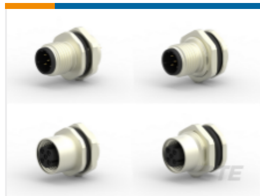
TE Part # CAT-C73765-M1G M12 Panel Mount Solder Cups