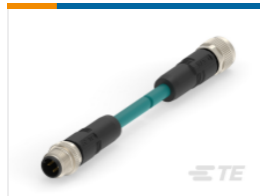
TE Part # TAD2453A201-001 M12D4-MS-FS-TPE-24UNSH-TEAL-0.5M