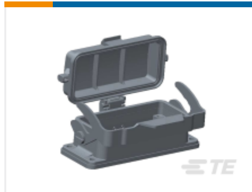
TE Part #T1510163000-000 H16B-AD-LB