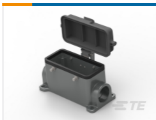
TE Part #T1460160121-000 H16B-SDR-BO-PG21