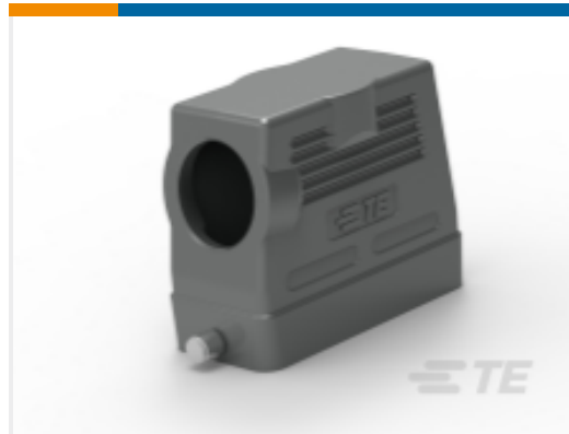
TE Part #T1330160140-000 H16B-TSH-RO-M40