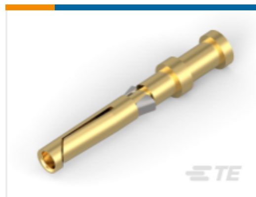
TE Part #T2020012005-000 DDF-0.5