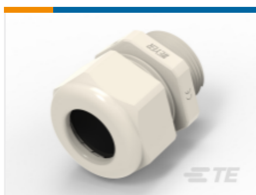
TE Part #T3209091201-000 HSK-P09G