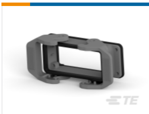
TE Part #T1410160000-000 H16B-AG-SL