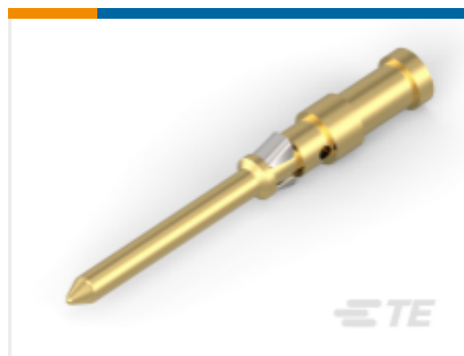
TE Part #T2020011005-000 DDM-0.5