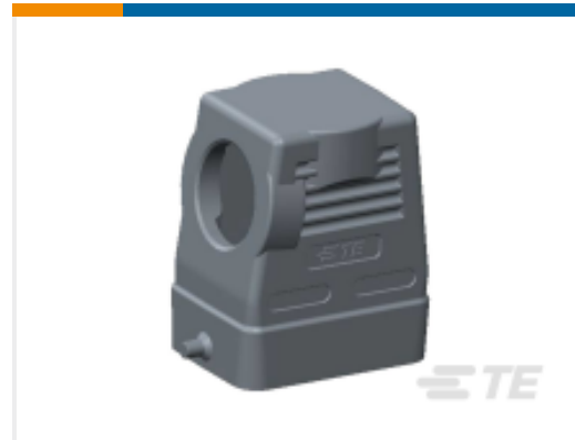
TE Part #T1330060132-000 H6B-TSH-M32