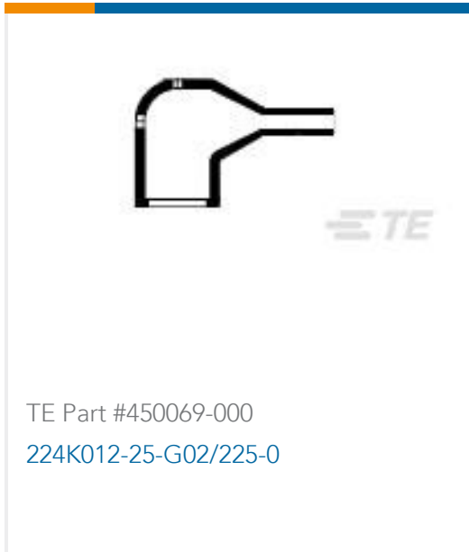
TE Part #450069-000 224K012-25-G02/225-0