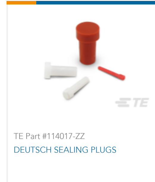
TE Part #114017-ZZ DEUTSCH SEALING PLUGS