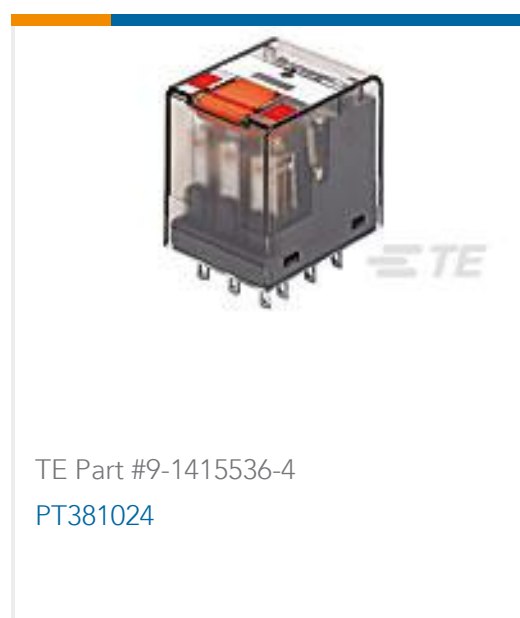
TE Part #9-1415536-4 PT381024