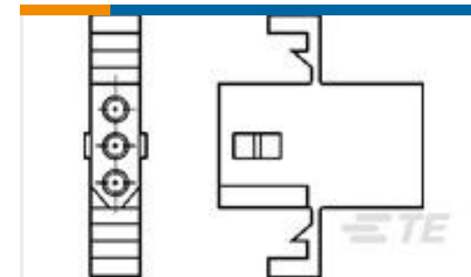
TE Part #770326-1 03P .062 COMM P&S RECPT