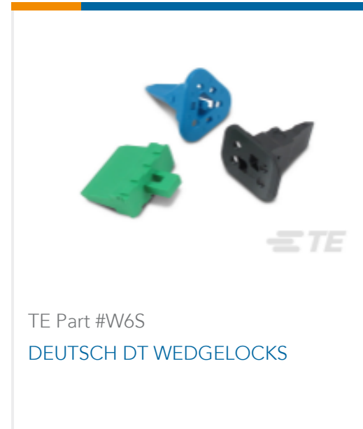
TE Part #W6S DEUTSCH DT WEDGELOCKS