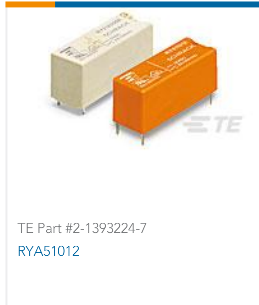
TE Part #2-1393224-7 RYA51012