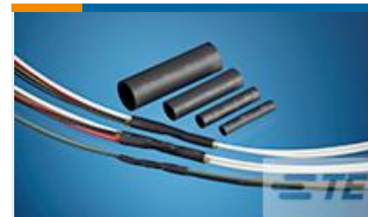
TE Part #2525596010 RBK-ILS-125-NR1-0-27MM