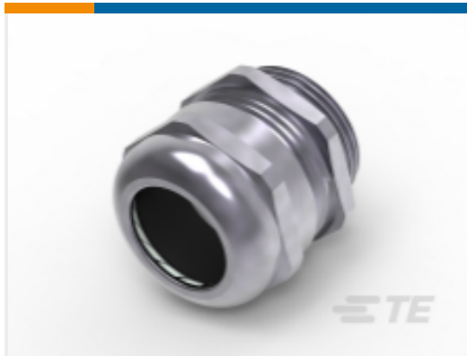
TE Part #T3706200103-000 DLX-20-MC (7-12)