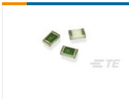
TE Part #7-1879126-6 RN 0402 205R 0.1% 10PPM CUT LENGTH