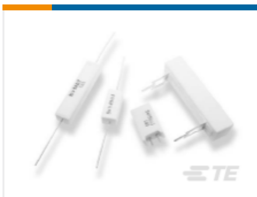
TE Part #1623787-1 Wirewound Resistor: Vertical Mount