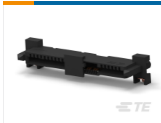
TE Part #1735104-3 PT30 XFP Connectors