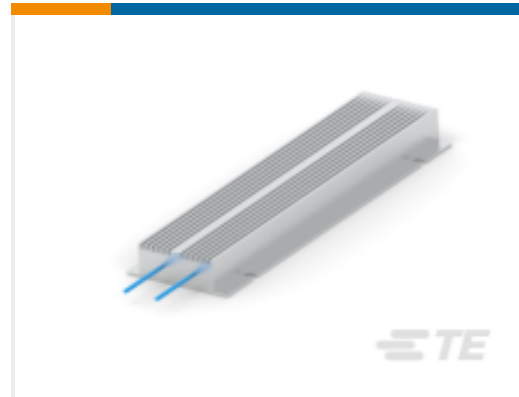
TE Part #2-1623821-1 Power Wirewound Resistor: Mineral, CFH