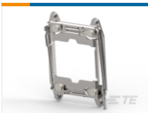
TE Part #2-2134533-1 LGA 2011 Hardware: ILM Assembly