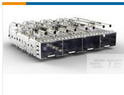
TE Part #2198234-2 SFP+ Enhanced 1x4, SAN Heatsink, LP