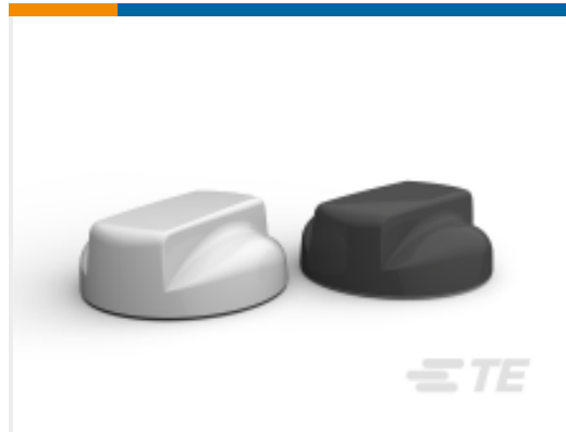
TE Part #1-2823595-1 LIGHT TRANSIT MIMO LTE ANTENNA