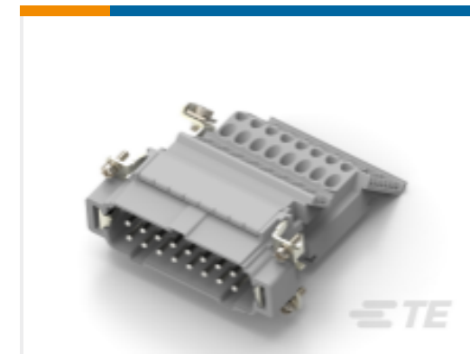
TE Part #T2100163101-000 HEAV-016-MS