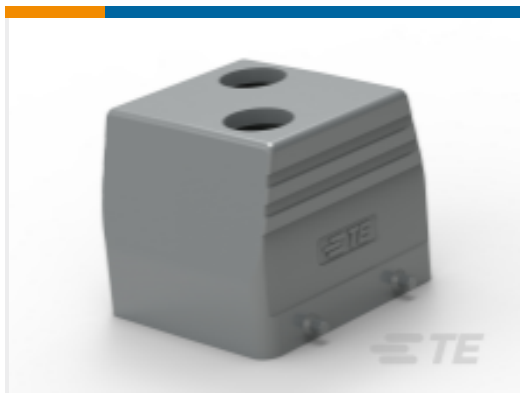
TE Part #T1220320225-000 H32B-TG-2M25