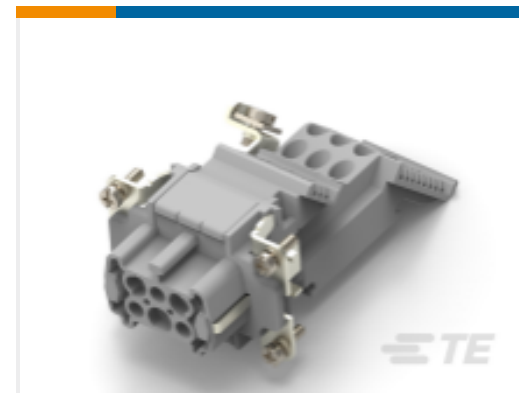
TE Part #T2100063201-000 HEAV-006-FS