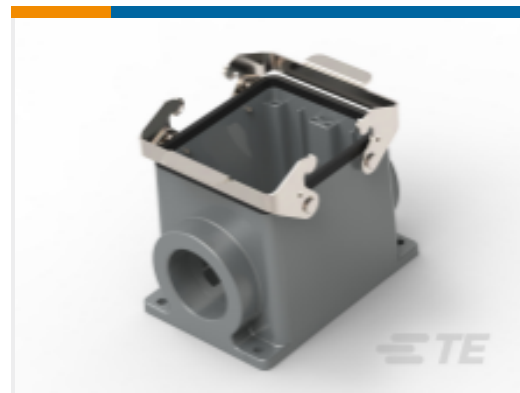
TE Part #T1440322232-000 H32B-SGR-2M32