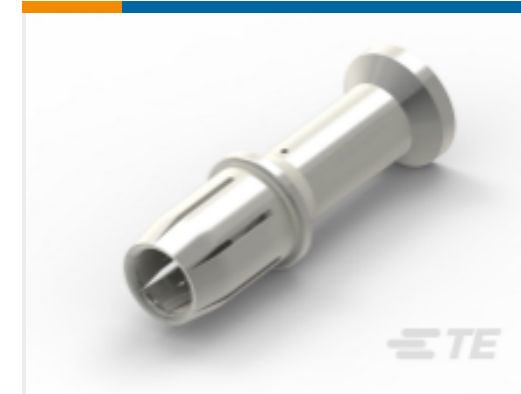
TE Part #T2050002010-000 CNF-10