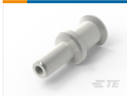
TE Part #T2060001035-000 CHM-35