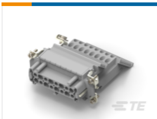
TE Part #T2100163201-000 HEAV-016-FS