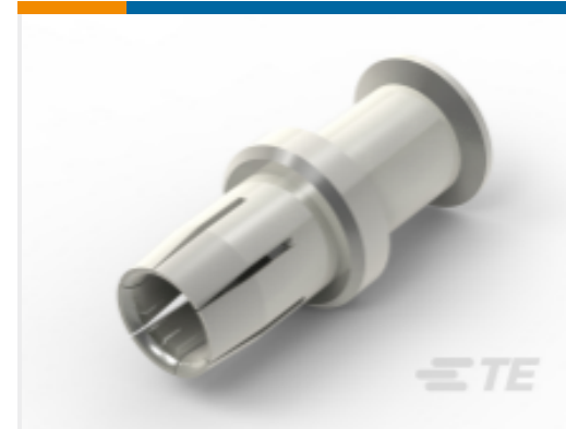
TE Part #T2060002035-000 CHF-35