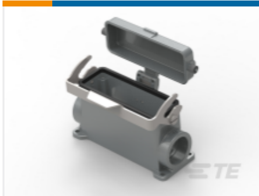
TE Part #T1660243232-000 H24B-SDRH-LB-2M32