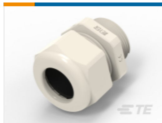
TE Part #T3209091201-000 HSK-P09G