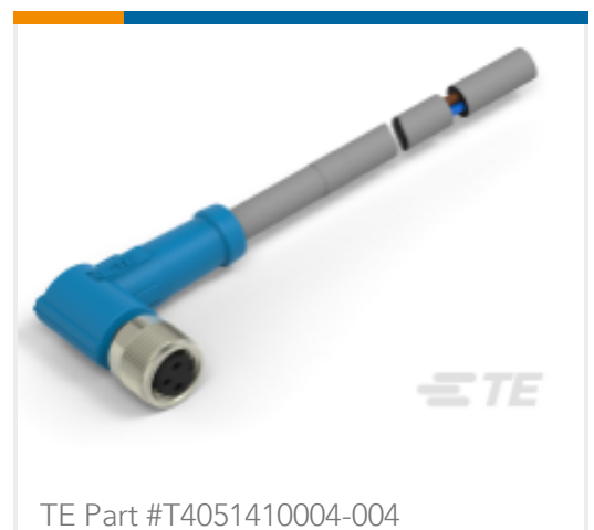
M8 FEMALE R/A SINGLE ENDED CABLE ASSY