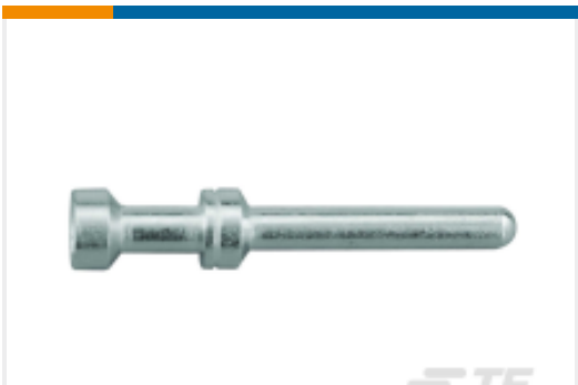
TE Part #T2030001008-000 CEM-0.75