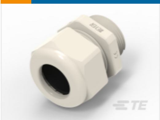
TE Part #T3209251222-001 HSK-M25G