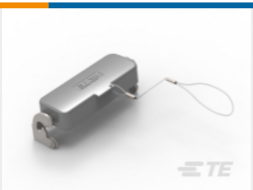
TE Part #T1019161201-001 H16A-KDTMS