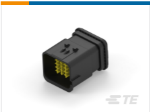
TE Part #2350891-1 20POS, HYBRID, PIN HSG ASSY, SLD, COD A