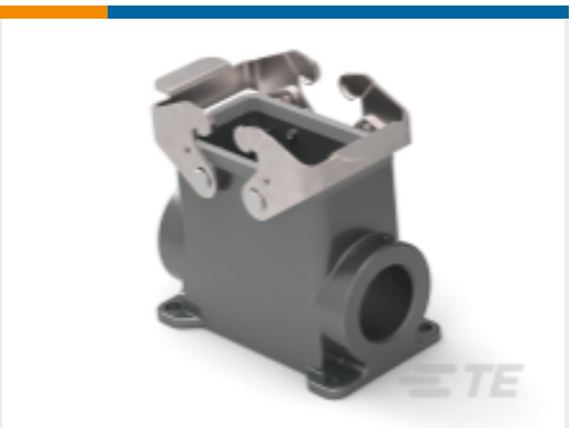
TE Part #T1470102121-000 H10B-SGRH-PG21