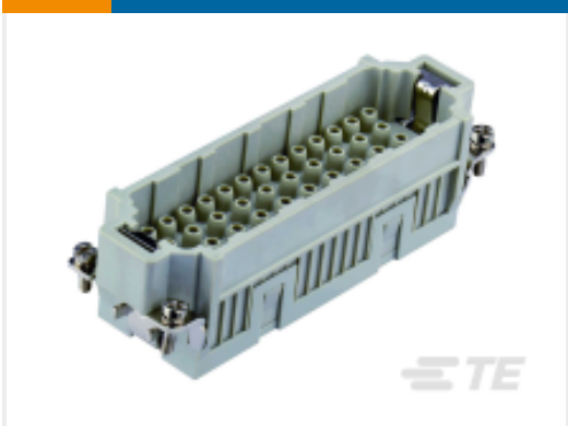
TE Part #T2050462101-000 HEE-046-M