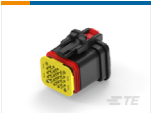
TE Part #2350890-1 20POS, HYBRID, SOC HSG ASSY, SLD, COD A