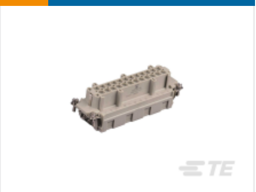
TE Part #T2040243201-000 HE-024-FS