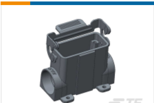
TE Part #T1619101220-000 H10A-SGRS-2M20