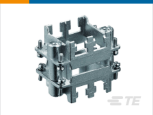
TE Part #T2070064001-000 H6BN-T2