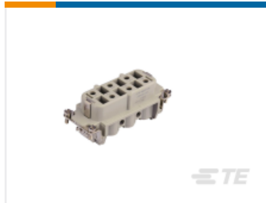
TE Part #T2060062201-000 HSB-006-F