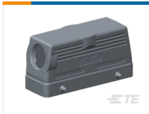
TE Part #T1210240121-000 H24B-TS-PG21