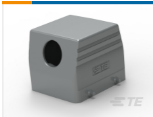
TE Part #T1210320129-000 H32B-TS-PG29