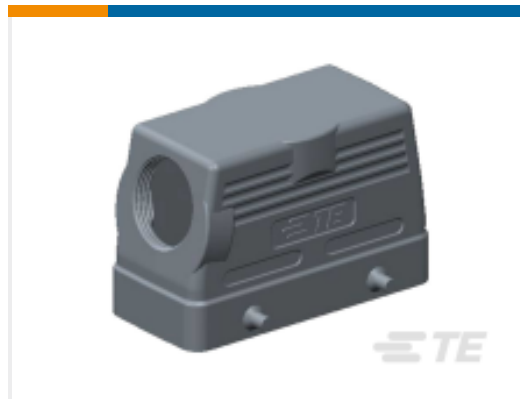
TE Part #T1210160121-000 H16B-TS-PG21