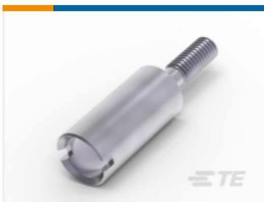
TE Part #T0931106527-000 CODING-PIN-M3-LTF