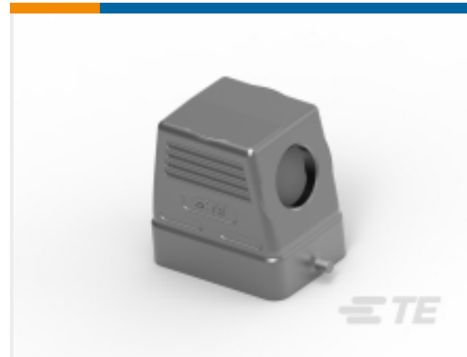
TE Part #T1310060116-000 H6B-TS-PG16