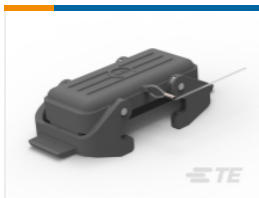
TE Part #T1010161200-000 H16B-KDTP