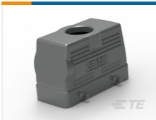
TE Part #T1220160121-000 H16B-TG-PG21