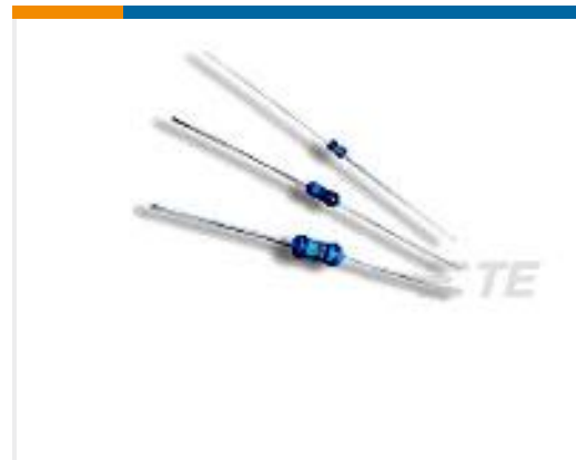
TE Part #1622480-1 LR1 1% 43R