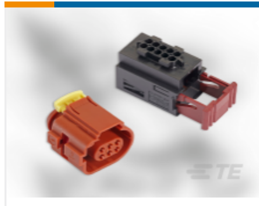
TE Part #282764-1 TIMER, CONNECTOR HOUSING