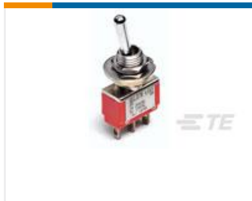
TE Part #3-1825137-8 A105SYZB04