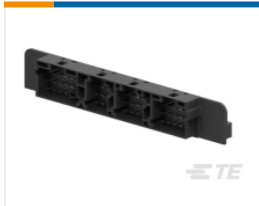
TE Part #963063-1 HIGH PIN COUNT HEADER