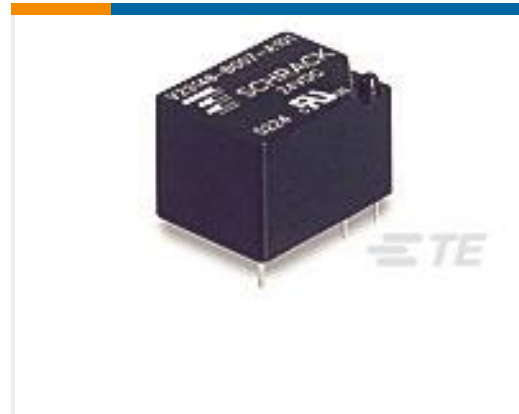
TE Part #1393203-8 V23148-A0005-A101