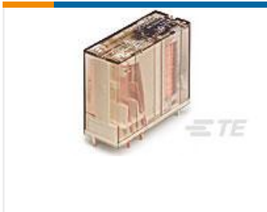
TE Part #1393258-5 V23047-A1012-A511