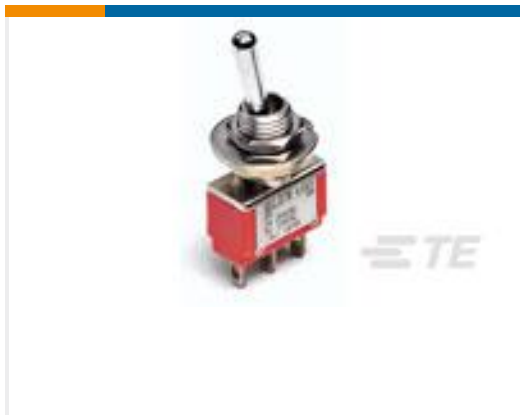
TE Part #3-1825137-6 A105SYCB04