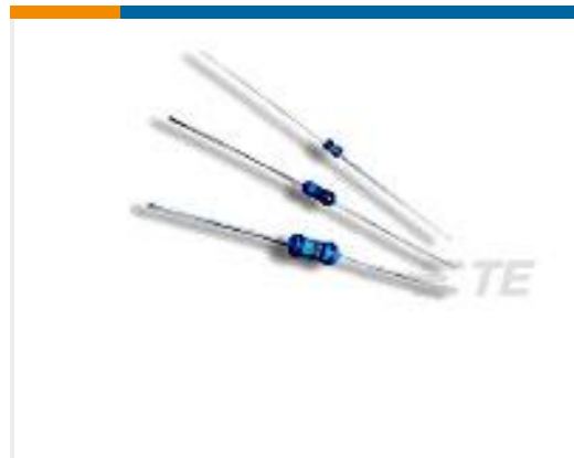
TE Part #1622407-2 LR1 1% 27K4