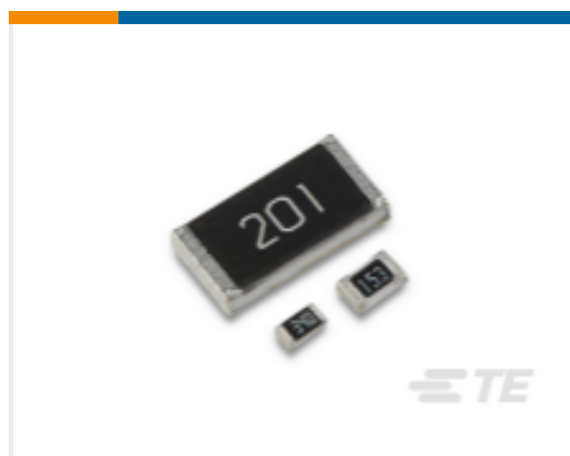
TE Part #2-2176329-5 CRGP 1210 1K0 1%