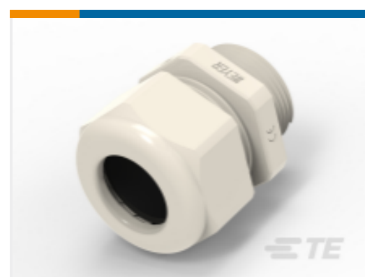
TE Part #T3209401222-001 HSK-M40G