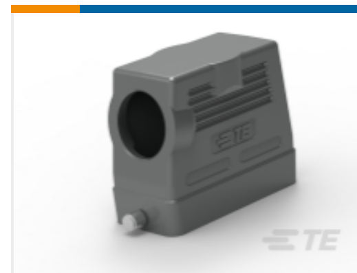
TE Part #T1330160140-000 H16B-TSH-RO-M40