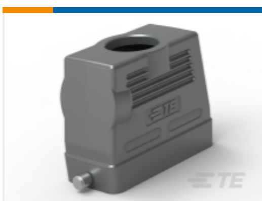
TE Part #T1340160140-000 H16B-TGH-RO-M40