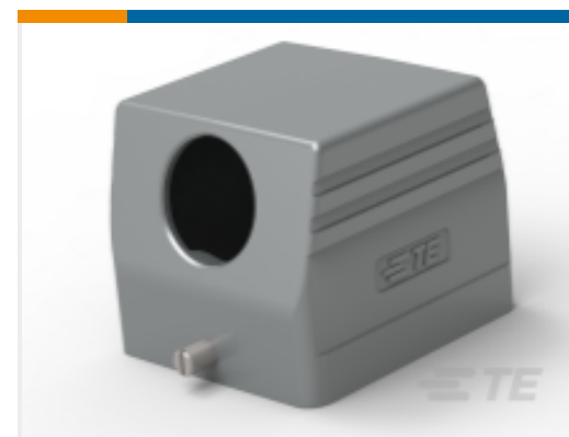
TE Part #T1310320140-000 H32B-TS-RO-M40