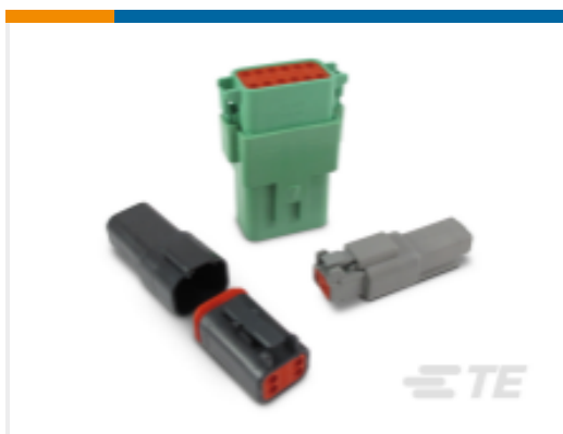
TE Part #DT04-3P-P004 DEUTSCH DT Series Housings & Connectors