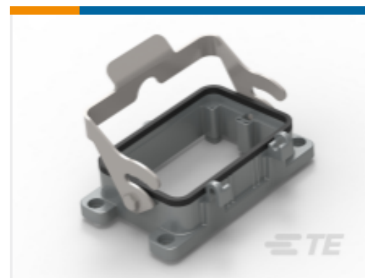
TE Part #T1500482000-000 H48B-AG-LB