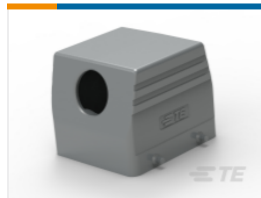
TE Part #T1210320132-000 H32B-TS-M32