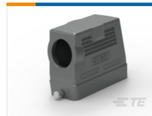
TE Part #T1330160132-000 H16B-TSH-RO-M32