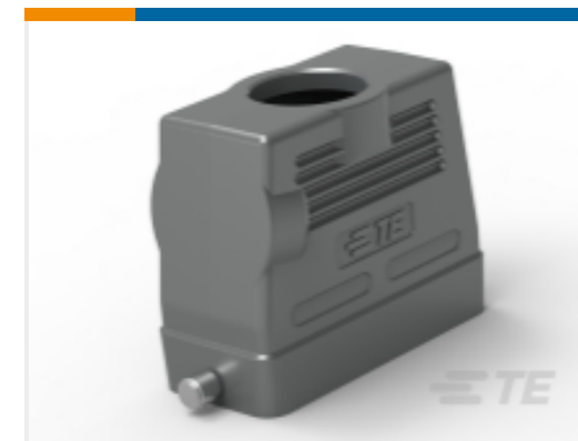
TE Part #T1340160132-000 H16B-TGH-RO-M32