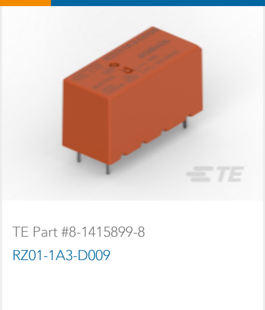
TE Part #8-1415899-8 RZ01-1A3-D009