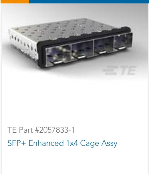
TE Part #2057833-1 SFP+ Enhanced 1x4 Cage Assy