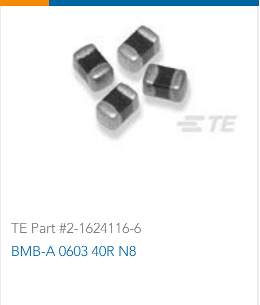
TE Part #2-1624116-6 BMB-A 0603 40R N8