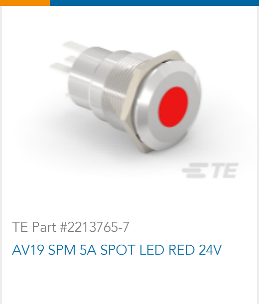
TE Part #2213765-7 AV19 SPM 5A SPOT LED RED 24V