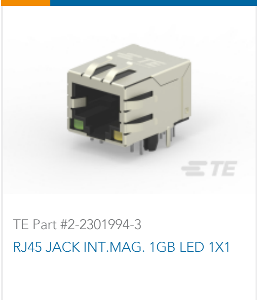
TE Part #2-2301994-3 RJ45 JACK INT.MAG. 1GB LED 1X1