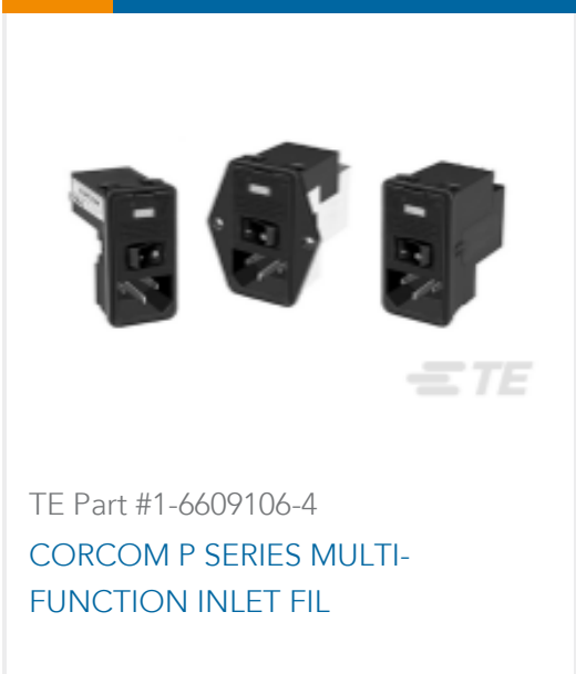
TE Part #1-6609106-4 CORCOM P SERIES MULTI- FUNCTION INLET FIL