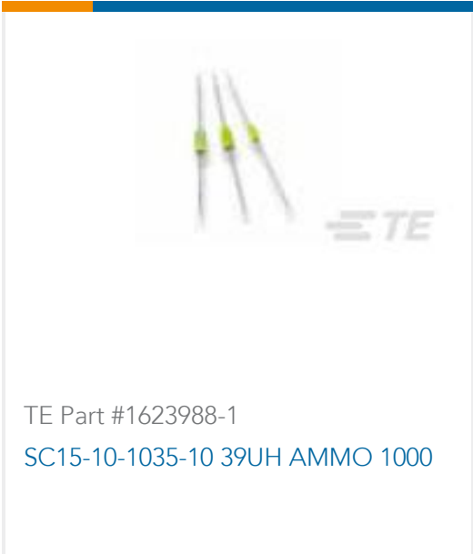
TE Part #1623988-1 SC15-10-1035-10 39UH AMMO 1000