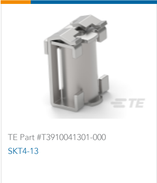
TE Part #T3910041301-000 SKT4-13