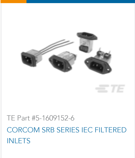
TE Part #5-1609152-6 CORCOM SRB SERIES IEC FILTERED INLETS