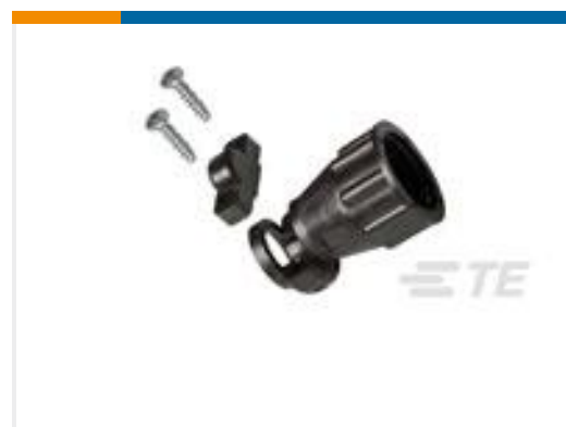
TE Part #1-206062-6 CABLE CLAMP KIT #11