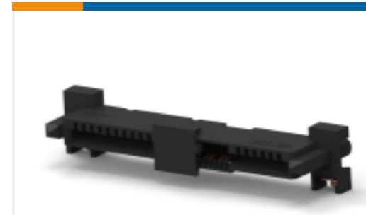
TE Part #1735104-4 PT30 XFP Connectors