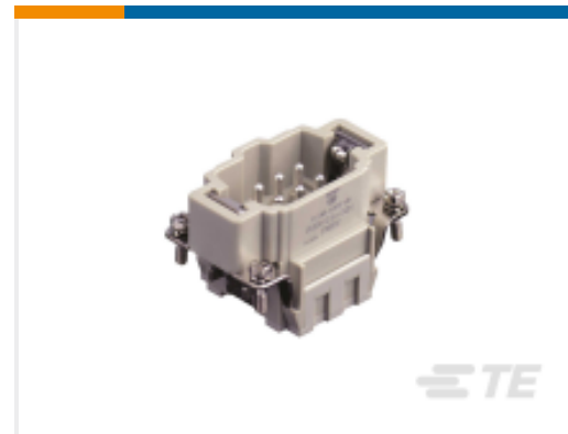
TE Part #T2040063101-000 HE-006-MS