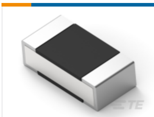
TE Part #1-2176304-2 RP 1E 0.1W 13R 0.1% 25PPM 5K RL