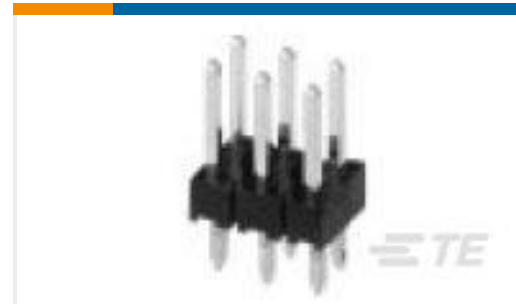
TE Part #104350-6 12 MODII HDR DRST B/A W/HD