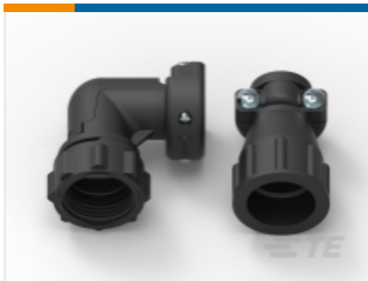
TE Part #1546347-2 CPC CABLE CLAMPS