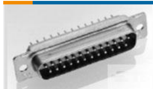
TE Part #1757823-7 AMPLIMITE, ASY, PLUG, STD, 90, ZN, 1, CT