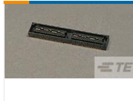
TE Part #1658012-2 MSB0.80RC-ASY080FL,-,10,-TY