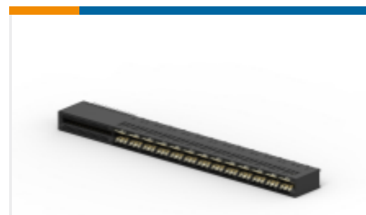
TE Part #2214913-1 MULTI-BEAM CE 2X13 P + 2X24 S VERTICAL