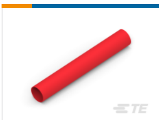
TE Part #NB14154001 VERSAFIT-1/2-2-FSP