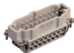
TE Part # T2040162101-000 HE-016-M