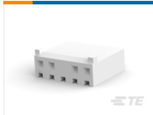
TE Part #2-640251-0 3.96mm Wire-to-board housing: receptacle, no mating alignment, SL 156