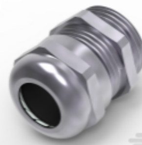
TE Part # T3609210101-000 DLX-21-MS