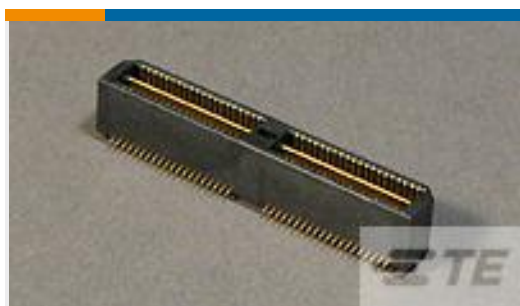
TE Part #1658014-2 MSB0.80PL8ASY080FL,-,10,-TY