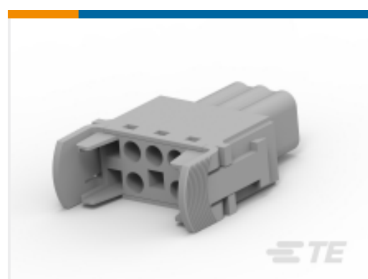
TE Part #T2110052201-000 HMN-005-FS