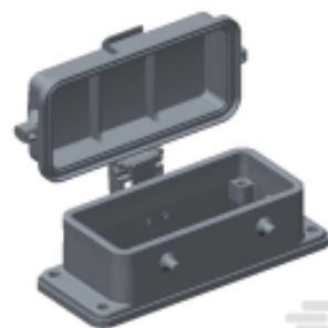
TE Part # T1430160000-000 H16B-AD-BO