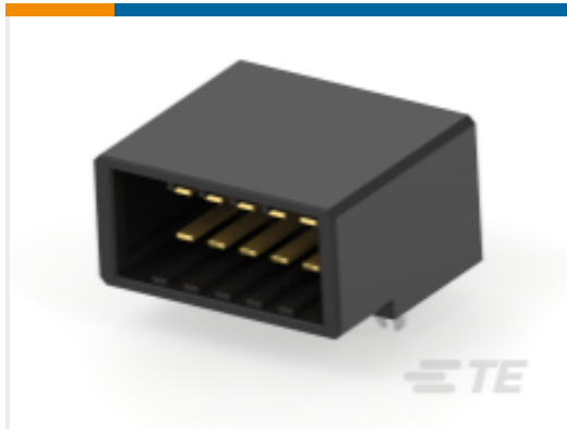
TE Part #3-178137-5 DYNAMIC 3100 HDR ASSY