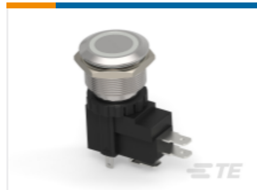
TE Part #2-2364686-8 AVH22 FLT SS LK RNG R&B 24V16A