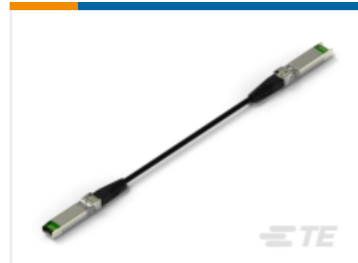
TE Part #2821224-7 SFP28 to SFP28 Cable Assembly: 26 AWG