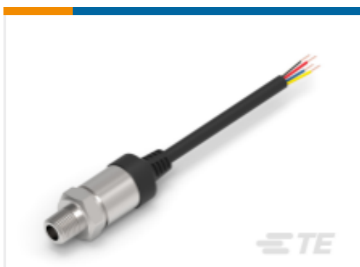
TE Part #20004013-00 PRESS XDCR M325P-00000E-025BG