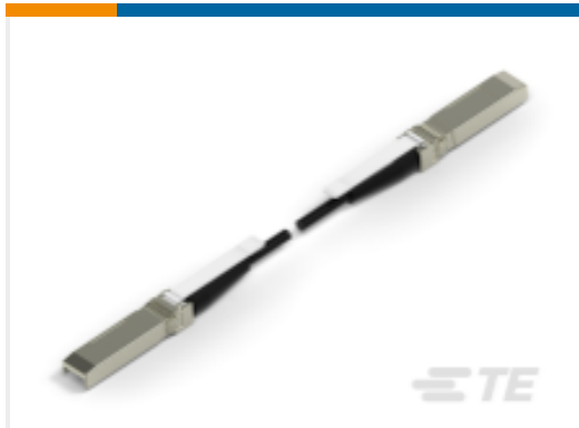
TE Part #2127933-1 SFP+ to SFP+ I/O Cable Assembly: 26 AWG