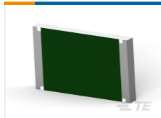
TE Part #2176406-9 3560 2R2 1%