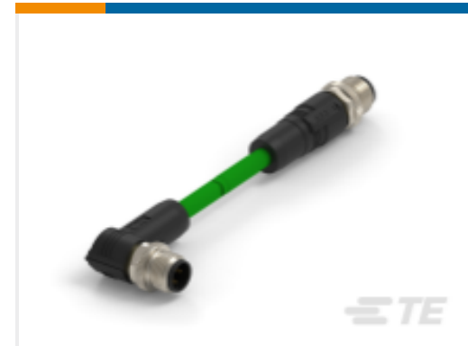
TE Part #TAD14841111-005 Ethernet, Profinet M12 D-Code 4p PVC DE