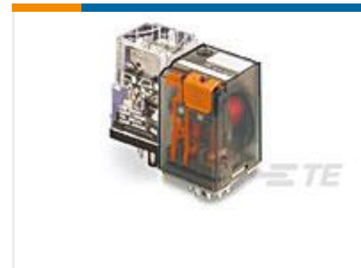
TE Part #3-2027011-9 KRPA-11DGF-125=RELAY,10A,2C, AGCDO,GOLD F