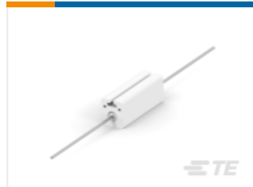
TE Part #1623723-2 Wirewound Resistor: Axial Mount, 17 Watt