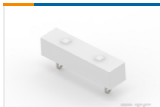
TE Part #2176409-1 SQH20 60R 5% WIRE