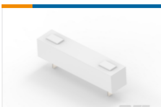
TE Part #1879556-7 SQH40 100R 5% WIRE 6.35MM FASTON HIGH MO