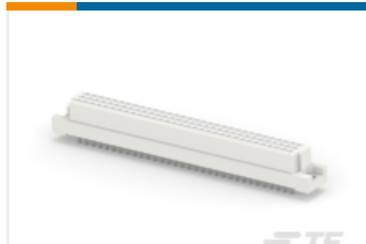
TE Part #3-2271014-0 CELLO,REC,64P,TH,V,FG,DIP3.0,-