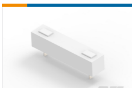
TE Part #1879556-4 SQH40 60R 5% (WIRE) 6.35MM FASTON