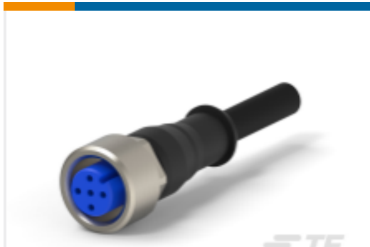
TE Part #2273049-1 M12 A-CODE FEMALE STRAIGHT PIGTAIL