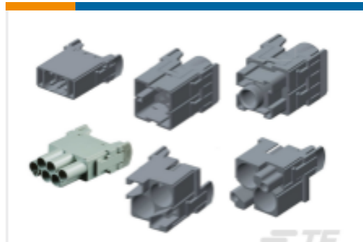
TE Part #T2111082101-007 HDC HMN - RAIL COMPLIANT MODULAR SYSTEM