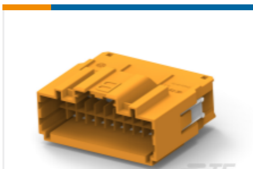
TE Part #2300962-2 22POS,0.64 GENER. Y,TAB HSG ASSY, COD B