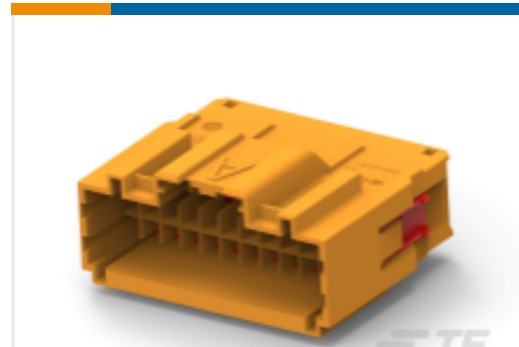
TE Part #2300962-1 22POS,0.64 GENER. Y,TAB HSG ASSY, COD A