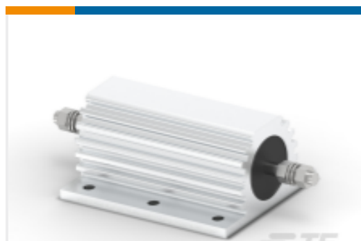
TE Part #5-1630019-8 HSC200 50R 5%