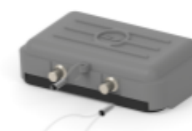
TE Part # T1010101600-000 H10B-KDTP-BO