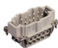
TE Part # T2040102101-000 HE-010-M