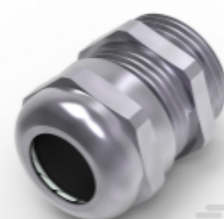
TE Part # T3609250102-000 DLX-25-M