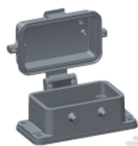
TE Part # T1430100000-000 H10B-AD-BO