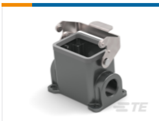
TE Part #T1610062120-000 H6B-SGRS-M20