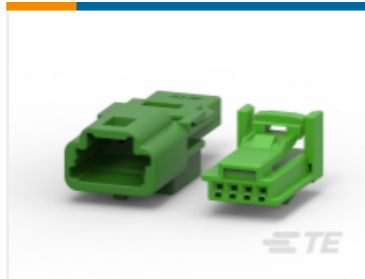
TE Part #1473203-1 TH/.025 CONNECTOR SYSTEM, HOUSING