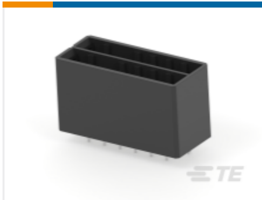
TE Part #1-917657-5 DYNAMIC 3200 HDR ASSY