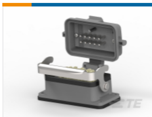
TE Part #T2120100219-000 ZGG-10DSTK,1-7,2-8,3-9,4-6,5-10