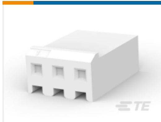
TE Part #640250-1 3.96mm Wire-to-board housing: receptacle, with mating alignment, SL 156