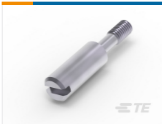
TE Part #T0931003003-000 CODING-PIN-M3