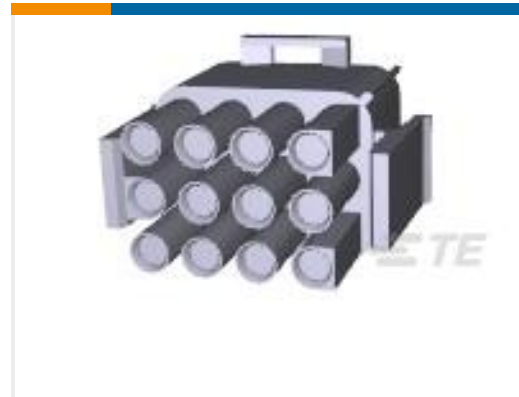
TE Part #1-480708-9 12P UMNL PLUG HSG BLK