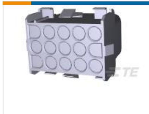
TE Part #1-480711-9 15P UMNL CAP HSG BLK