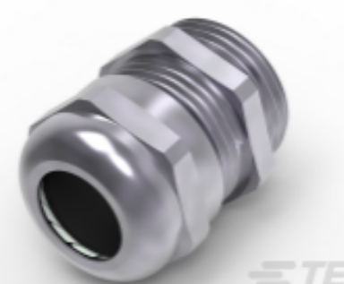
TE Part # T3609250102-000 DLX-25-M