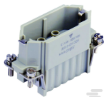
TE Part # T2020152101-000 HD-015-M