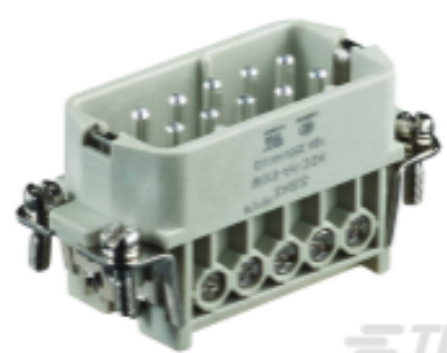
TE Part # T2010102101-000 HA-010-M