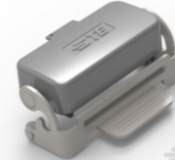
TE Part # T1019101101-001 H10A-KDTMS-NA