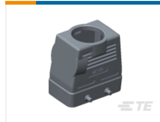
TE Part #T1240100129-000 H10B-TGH-PG29