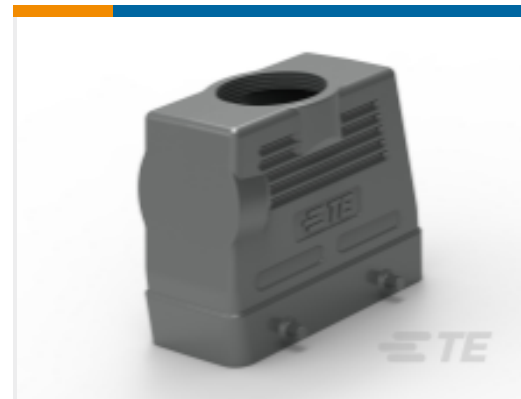
TE Part #T1240160121-000 H16B-TGH-PG21