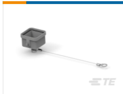
TE Part #T1010033101-000 H3A-KDBM-SS