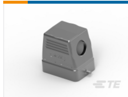
TE Part #T1310060121-000 H6B-TS-PG21