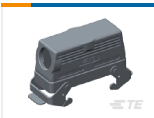
TE Part #T1250242121-000 H24B-TSB-PG21