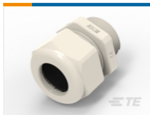
TE Part #T3209321222-001 HSK-M32G