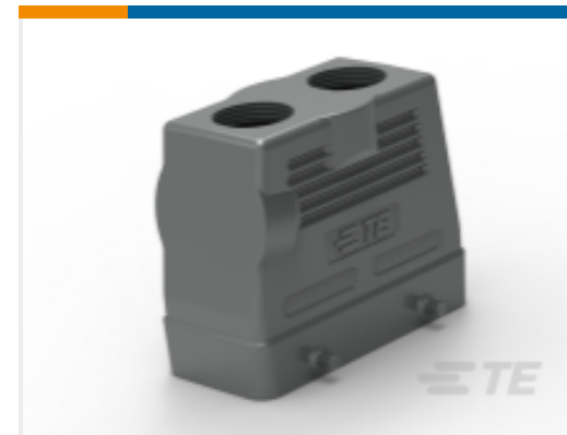
TE Part #T1240160225-000 H16B-TGH-2M25