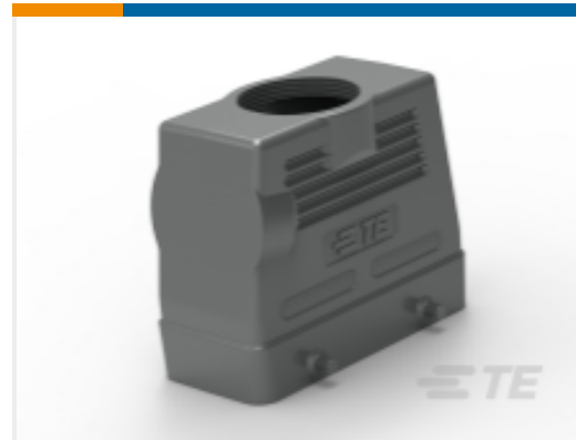
TE Part #T1240160125-000 H16B-TGH-M25