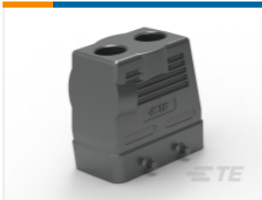
TE Part #T1240100220-000 H10B-TGH-2M20