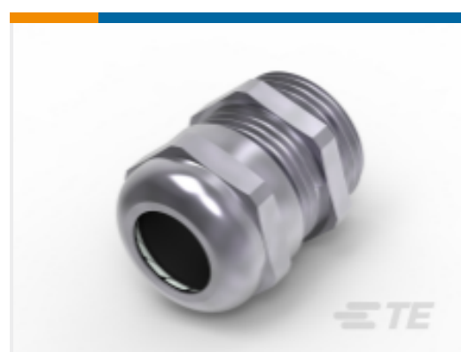
TE Part #T3609400102-000 DLX-40-M