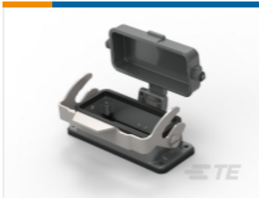
TE Part #T1510163001-000 H16B-ADM-LB