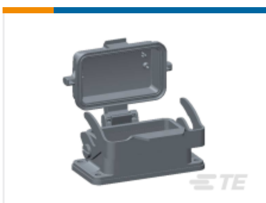
TE Part #T1510103000-000 H10B-AD-LB