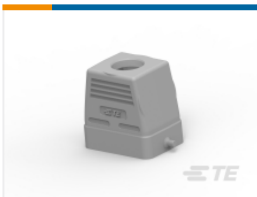
TE Part #T1320060116-000 H6B-TG-PG16