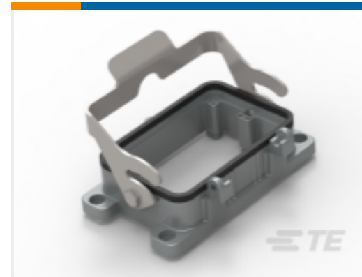
TE Part #T1500482000-000 H48B-AG-LB