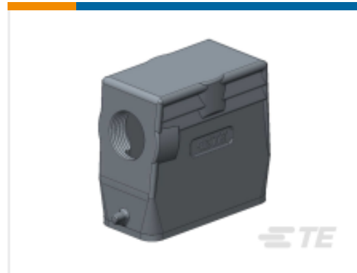
TE Part #T1319100116-000 H10A-TS-PG16