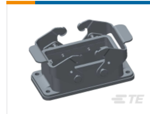
TE Part #T1410102000-000 H10B-AG