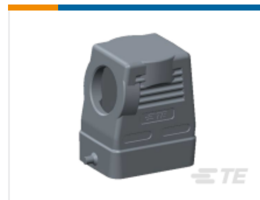
TE Part #T1330060121-000 H6B-TSH-PG21