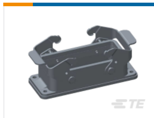
TE Part #T1410162000-000 H16B-AG