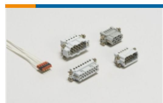
Rectangular Contact Inserts(15)