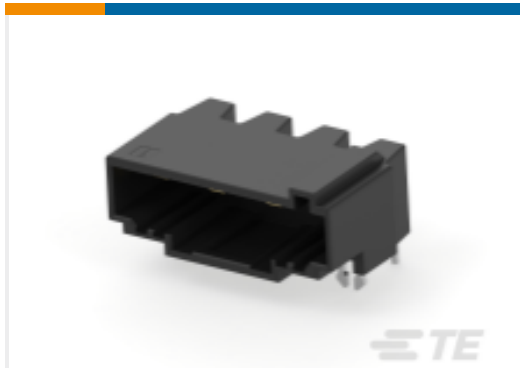
TE Part #3-2289080-1 DYNAMIC 3950 ASSY