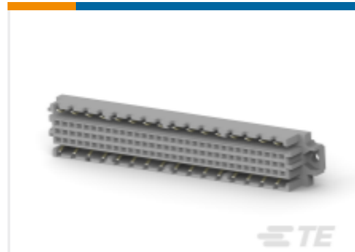
TE Part #5650992-5 ASSY,RECPT,ENH.TYPE C, EUROCARD,L-FREE,5