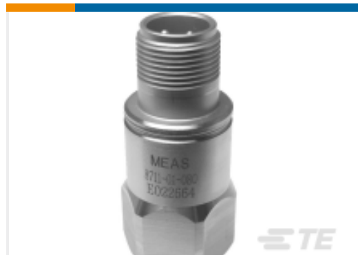
TE Part #8711-01-080 MODEL 8711-01 ACCELEROMETER