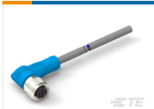
TE Part #T4151420004-007 M12 A-CODE FEMALE R/A SINGLE ENDED CABL