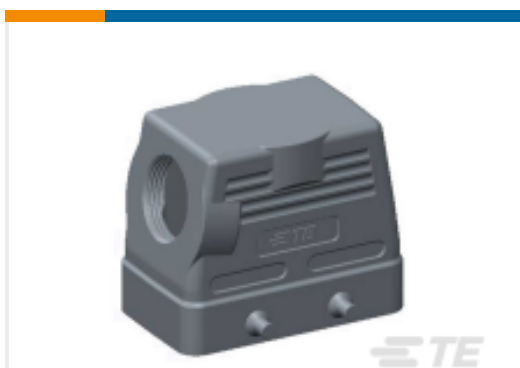
TE Part #T1210100116-000 H10B-TS-PG16