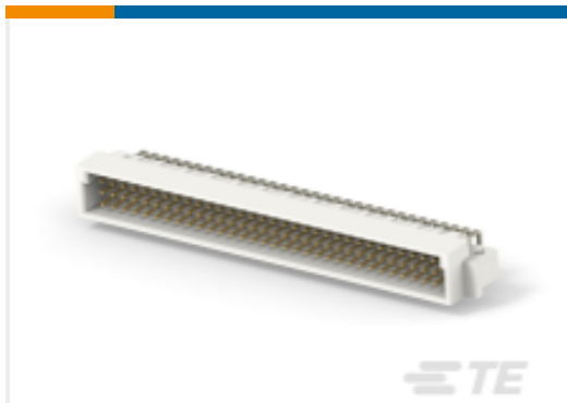
TE Part #6-2271013-0 CELLO,PIN,96P,TH,RA,FG,DIP4.0,-