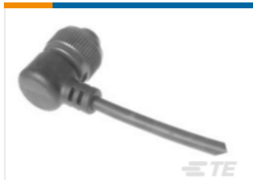
TE Part #318A-120 CABLE 318A