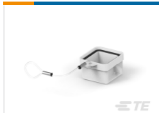
TE Part #T1009033100-000 H3A-KDBP