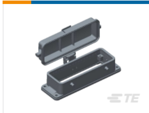
TE Part #T1430240000-000 H24B-AD-BO