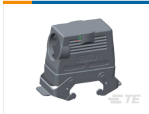
TE Part #T1270162129-000 H16B-TSBH-PG29