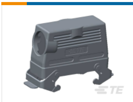
TE Part #T1270242129-000 H24B-TSBH-PG29