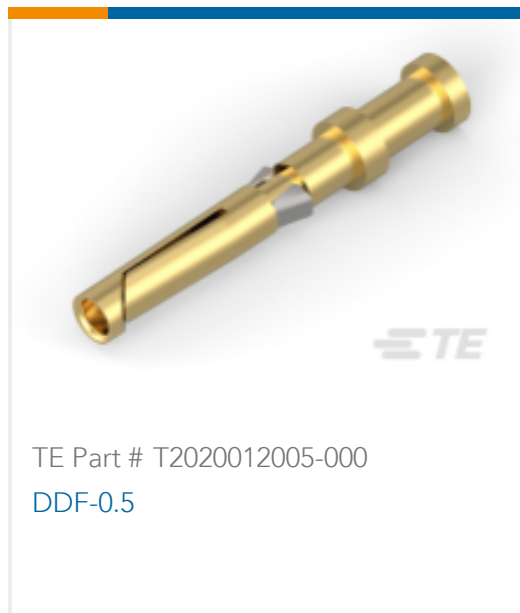
TE Part # T2020012005-000 DDF-0.5