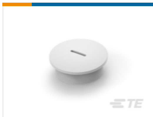
TE Part #T3166320111-000 BLIND-32-PM