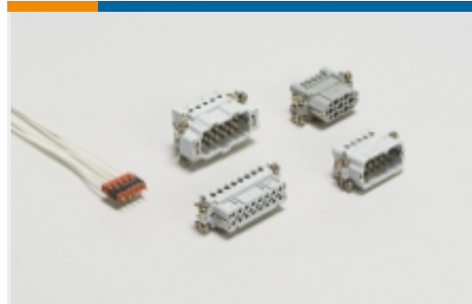
Rectangular Contact Inserts(15)