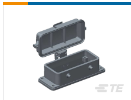
TE Part #T1430160000-000 H16B-AD-BO