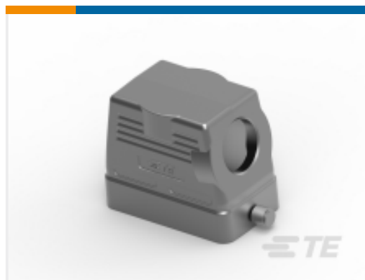
TE Part #T1310100125-000 H10B-TS-RO-M25