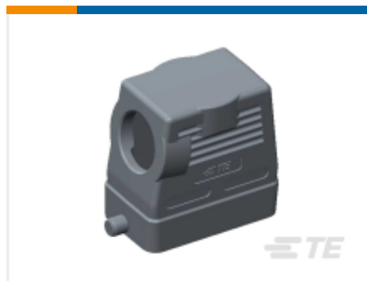
TE Part #T1330100132-000 H10B-TSH-RO-M32