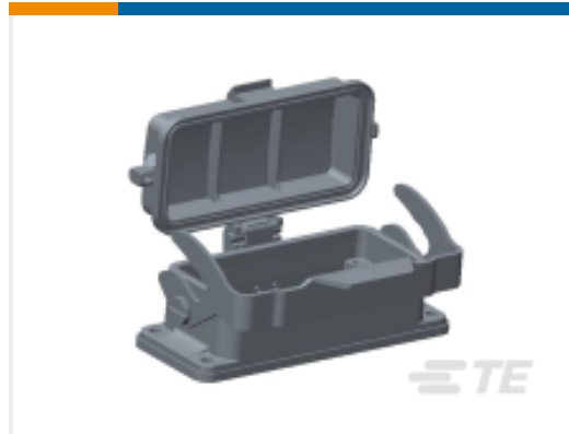
TE Part #T1510163000-000 H16B-AD-LB