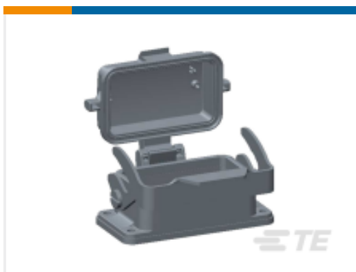
TE Part #T1510103000-000 H10B-AD-LB