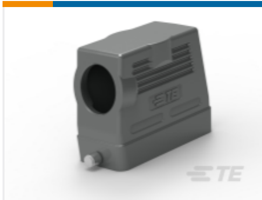
TE Part #T1330160140-000 H16B-TSH-RO-M40