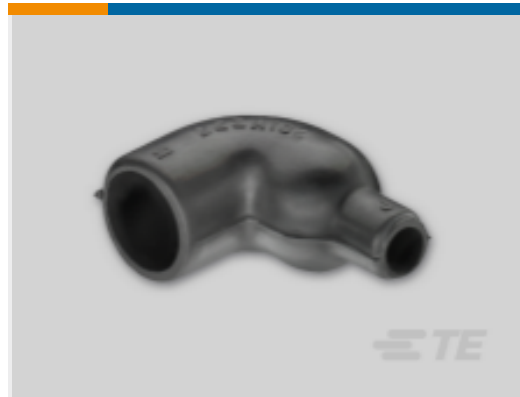
TE Part #822841-000 Bulbous Heat Shrink Boots: Lipped, Right Angle