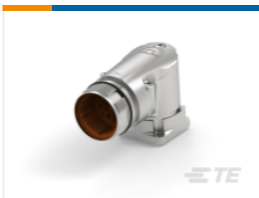
TE Part #CGE271N00000051000 940 RECEPTACLE ANGLED, ROTATABLE,SP-READY