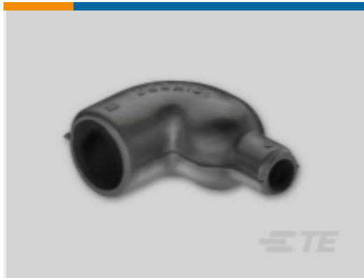
TE Part #814714-000 Heat Shrink Boots: Non Lipped, Right Angle