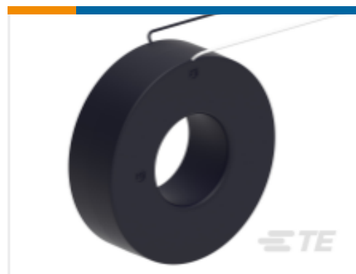
TE Part #CG3723-000 CI-5RL401