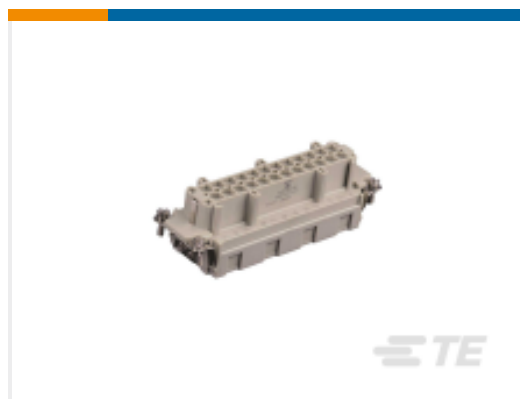
TE Part #T2040243201-000 HE-024-FS