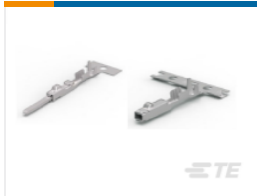
TE Part #7-1452659-3 MCON, RECEPTACLE AND TAB