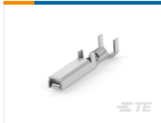
TE Part #2298107-3 DYNAMIC 3000 CONTACT