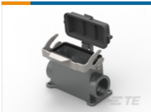
TE Part #T1660163232-000 H16B-SDRH-LB-2M32