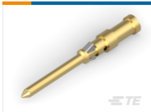
TE Part #T2020011010-000 DDM-1.0