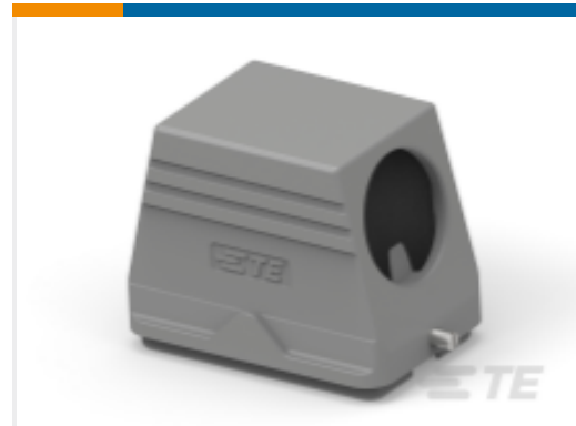
TE Part #T1310480148-000 H48B-TS-RO-PG48