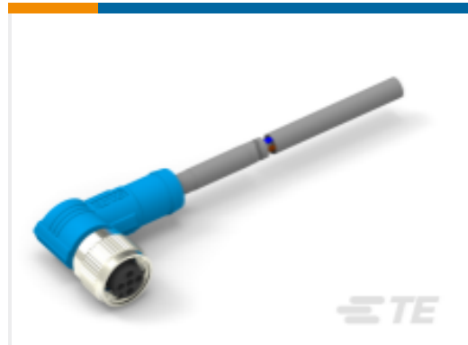
TE Part #T4151410004-004 M12 A-CODE FEMALE R/A SINGLE ENDED CABL