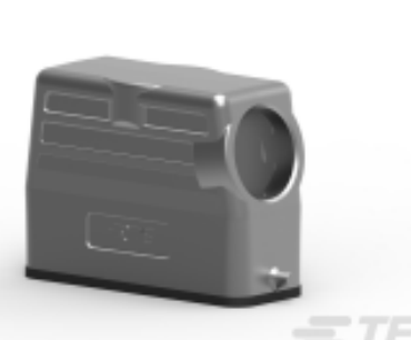
TE Part # T1319160125-000 H16A-TS-M25