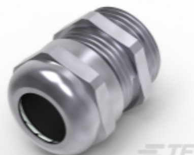
TE Part # T3609250102-000 DLX-25-M