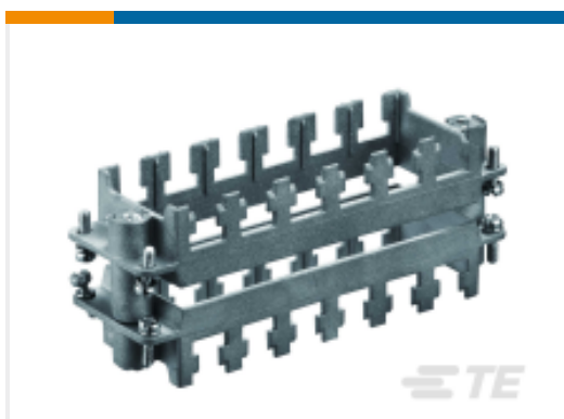
TE Part #T2070244001-000 H24BN-T6