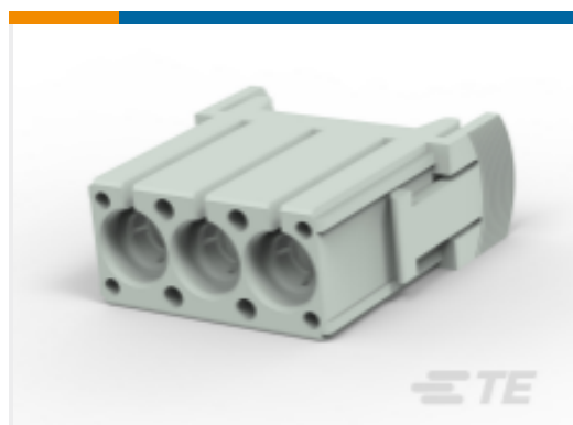
TE Part #T2111032301-000 HMN-PA3