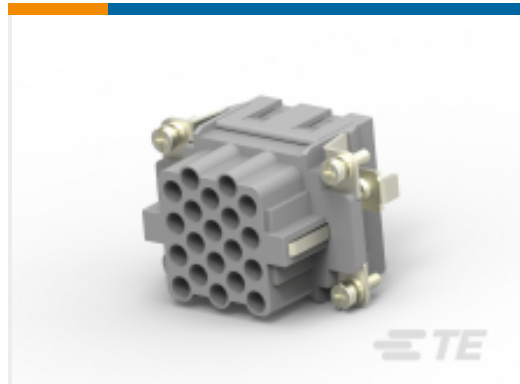
TE Part #T2050202201-000 HEEE-020-F