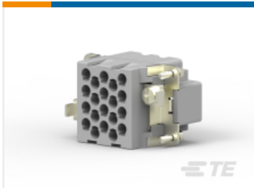
TE Part #T2050202101-000 HEEE-020-M