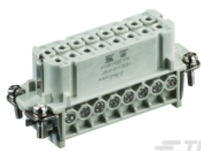
TE Part # T2010162201-000 HA-016-F