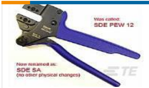
TE Part #91391-1 SDE PEW 12MICRO MNL HAND TOOL