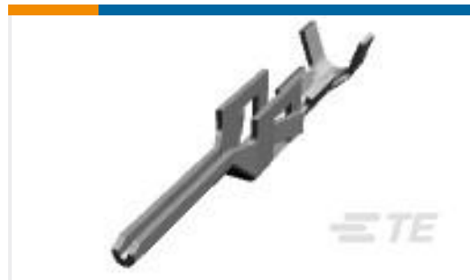
TE Part #1-794613-2 PIN CONT 26-30 30 GOLD L/P