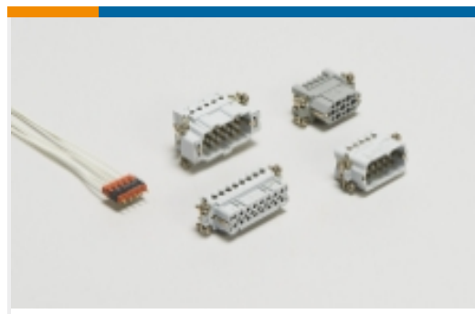
Rectangular Contact Inserts(135)