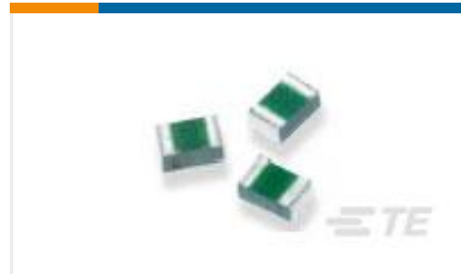
TE Part #1624345-1 NTC0805 5% 10K