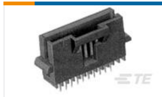
TE Part #5-104071-2 05 SYSTEM 50 HDR SRST SHRD SN