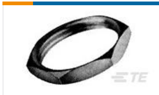
TE Part #1-329631-2 JAM NUT, PLATED