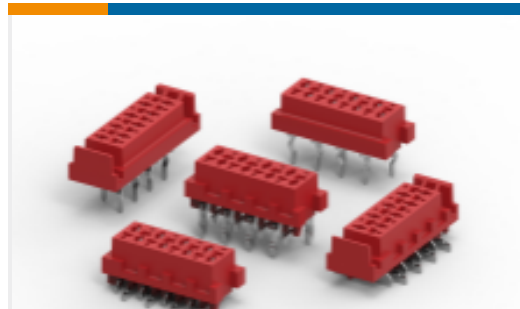
TE Part #338068-6 FEMALE-ON-BOARD CONNECTOR TOP ENTRY