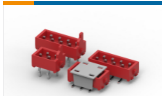
TE Part #338728-6 MALE-ON-BOARD CONNECTOR