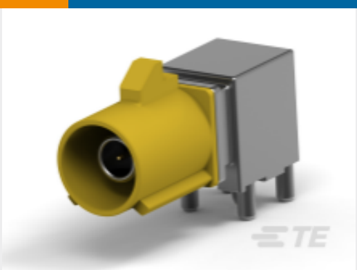
TE Part #1-2291392-0 MALE ASM, 1 POS, R/A, PCB, FAKRA