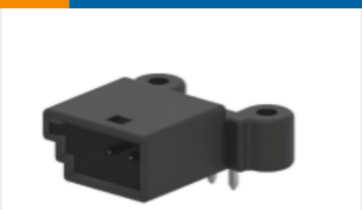
TE Part #1746909-1 SIGNAL HEADER