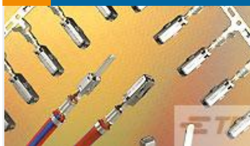
TE Part #936613-1 2.8MM MCP-E TAB CONT