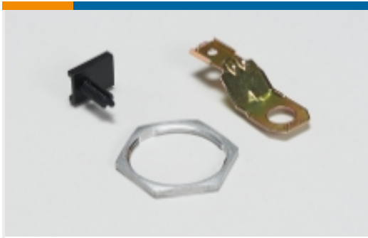
Other Automotive Connector Accessories(31)