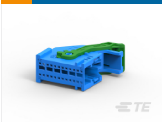
TE Part #2209954-4 AIRBAG 24P COVER ASSY