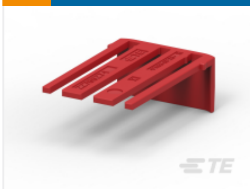
TE Part #2278827-1 2. LOCK,67POS_FOR_MCP2.8