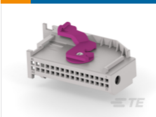
TE Part #2050723-4 COVER FOR MQS HSG 2x16 POS ASSY