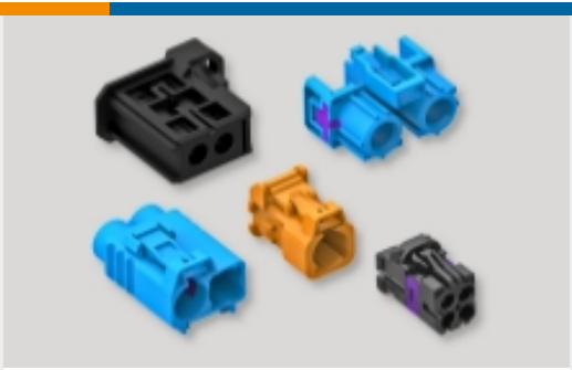
Data Connectivity Housings(380)