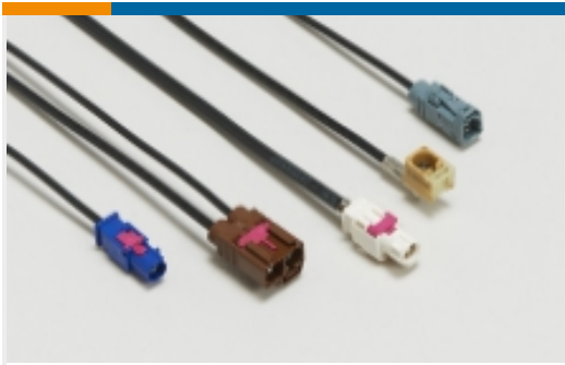
Infotainment & Multimedia Cable Assemblies(1)