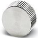
Metal protection cap for connectors with M17 external thread

Metal protective cap - ST-Z0014 - 1616069