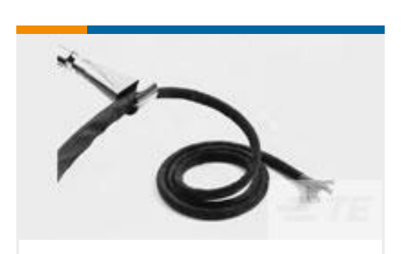
TE Part #CB03334007 RW-200-E-1/4-0-SP