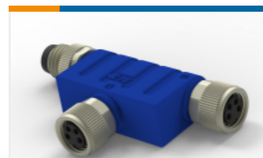
TE Part #T4082102004-000 M8 T DISTRIBUTOR MALE 4POS