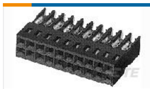
TE Part #102393-3 10 AMPMODU MT ASSY DR .100CL