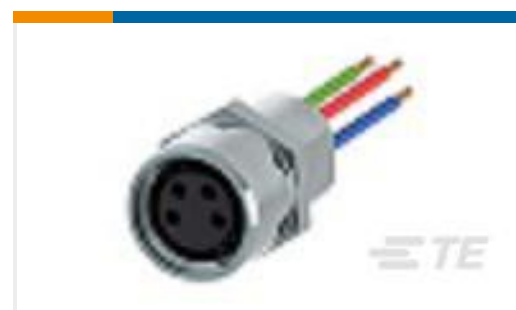
TE Part #1-2120959-1 M8 FEMALE SOCKET WITH WIRES, 0.25 SQMM