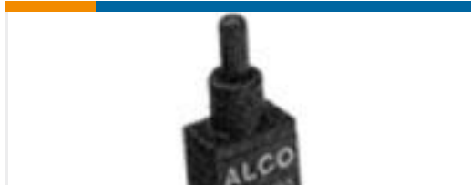
TE Part #1571990-4 TSPD11CGRA004