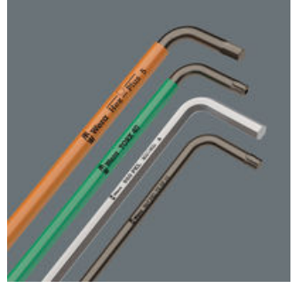
The size of each L-keys has been engraved by a laser. In addition Take it easy L-keys have a colour coding according to sizes – for simple and rapid accessing of the required tool. Making it easy to find the right tool.