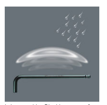
L-keys with BlackLaser surface treatment for outstanding surface protection and long service life. High corrosion protection.