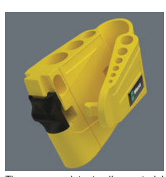
The wear-resistant clip material ensures that the L-keys are securely held yet are easy to remove.