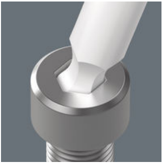
The spherical drive profile means that it is possible to swivel the axis of the tool to that of the screw, and therefore enable angled, "around-the-corner" screwdriving jobs.