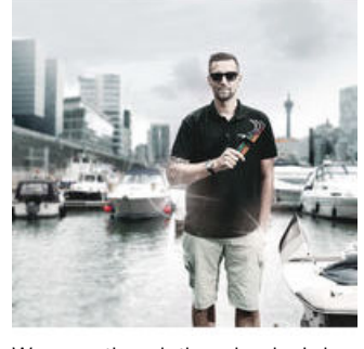
We questioned the classic L-key design, since all too often the screw head recess is rounded out, meaning screws can no longer be tightened or loosened – and so the user finds the L-key slipping out of the recess. Wera Hex-Plus tools have a larger contact surface in the screw head. The notching effects are reduced and thereby the deformation of the screws. At the same time, as much as 20 % more torque can be applied.