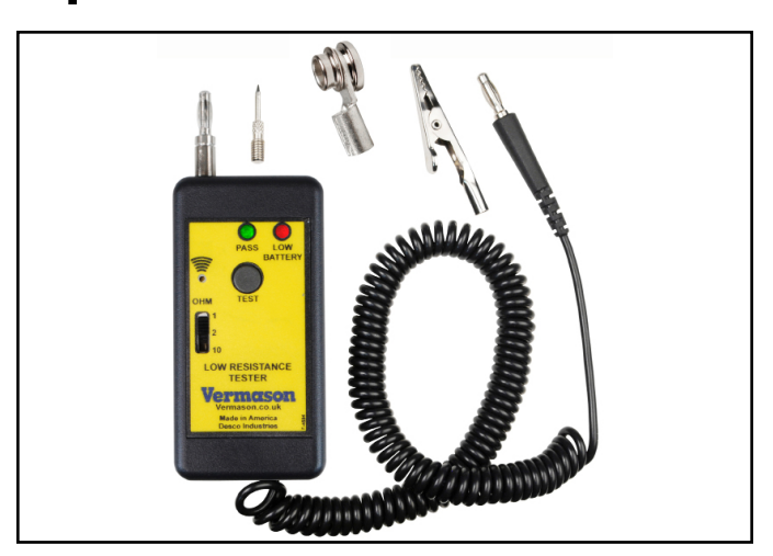
Figure 1. Vermason 222645 Low Resistance Tester