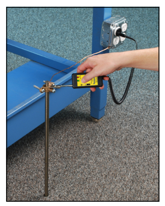
Figure 4. Testing auxiliary ground with the 222645 tester