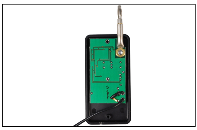
Figure 6. Removing the back cover