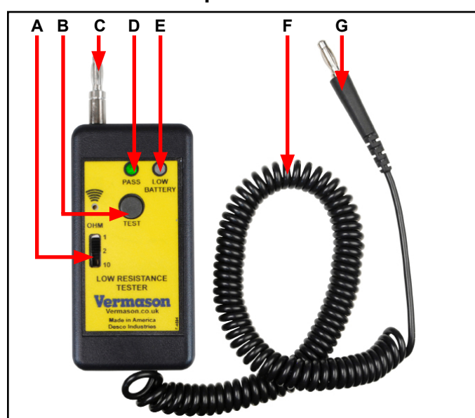
Figure 2. Low Resistance Tester features and components