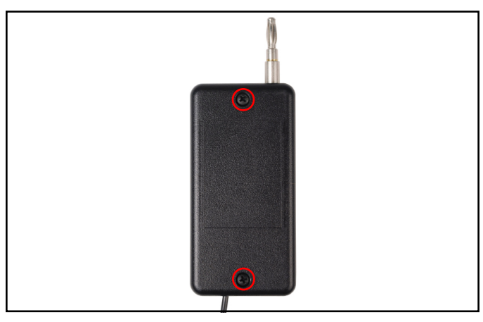
Figure 5. Locating the enclosure screws