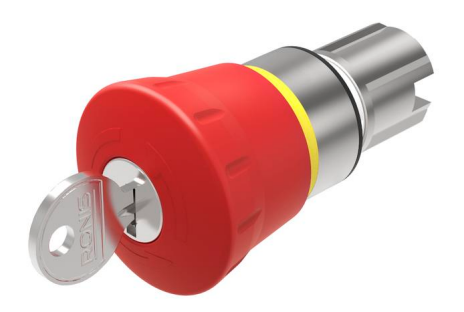
Attention: The preview is based on a sample product. This can differ from your current configuration.