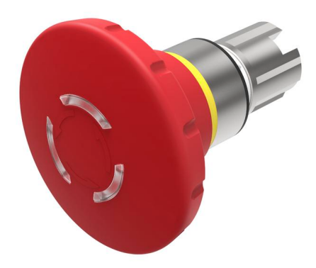
Attention: The preview is based on a sample product. This can differ from your current configuration.