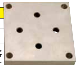
LC1000-BP4, base plates shown smaller than actual size.

Visit omega.com/lc1000-tp for top mounting plates.