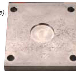
LC1000-TP4, top plates shown smaller than actual size.

PT06F10-6S-R, mating connector (not included).