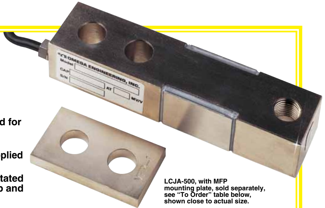
LCJA-500, with MFP mounting plate, sold separately, see "To Order" table below, shown close to actual size.